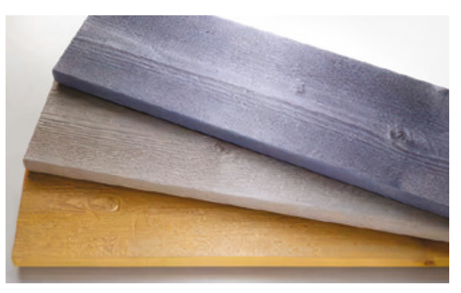
On-trend metallic effect on freshly sawn wood: CETOL WF 771 combined with the WV 810 effect pigment

An increasingly popular, on-trend look, metallic-effect wood has its very own visual appeal. The effect can be varied by changing the amount of metallic pigment added (no more than 5%). WV 810 effect pigment is available in 10 kg packs.