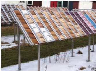
The same conditions for all: we use identical test equipment across Europe, which is aligned with a tilt angle of 45° towards the south west.