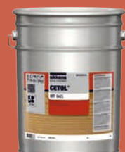
CETOL® WF 945