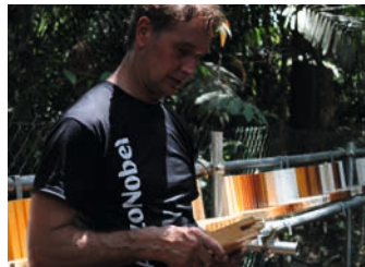
The effects of tropical climate conditions on wood treated with our products are checked locally.